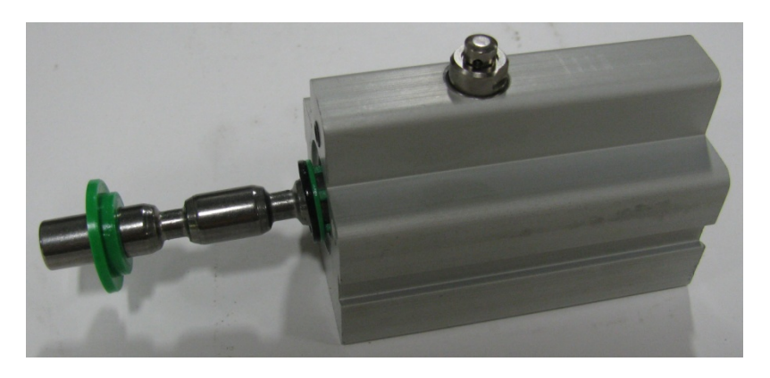
An ISO 9001 Registered Company

Reassemble foot pedal and test. If the foot pedal does not operate you will need a new foot pedal (part number 200496).